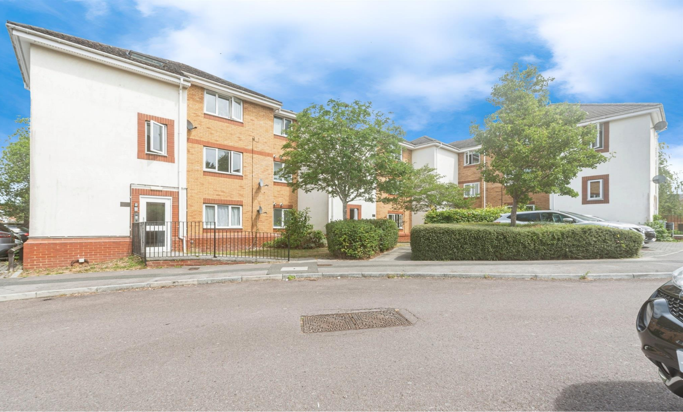
Redshank Court, Thatcham, RG19 3UE