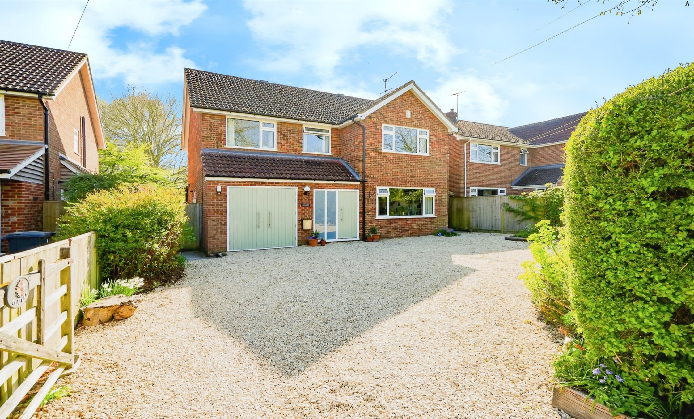
Alizeti, The Croft, Aston Tirrold, Didcot OX11 9DL