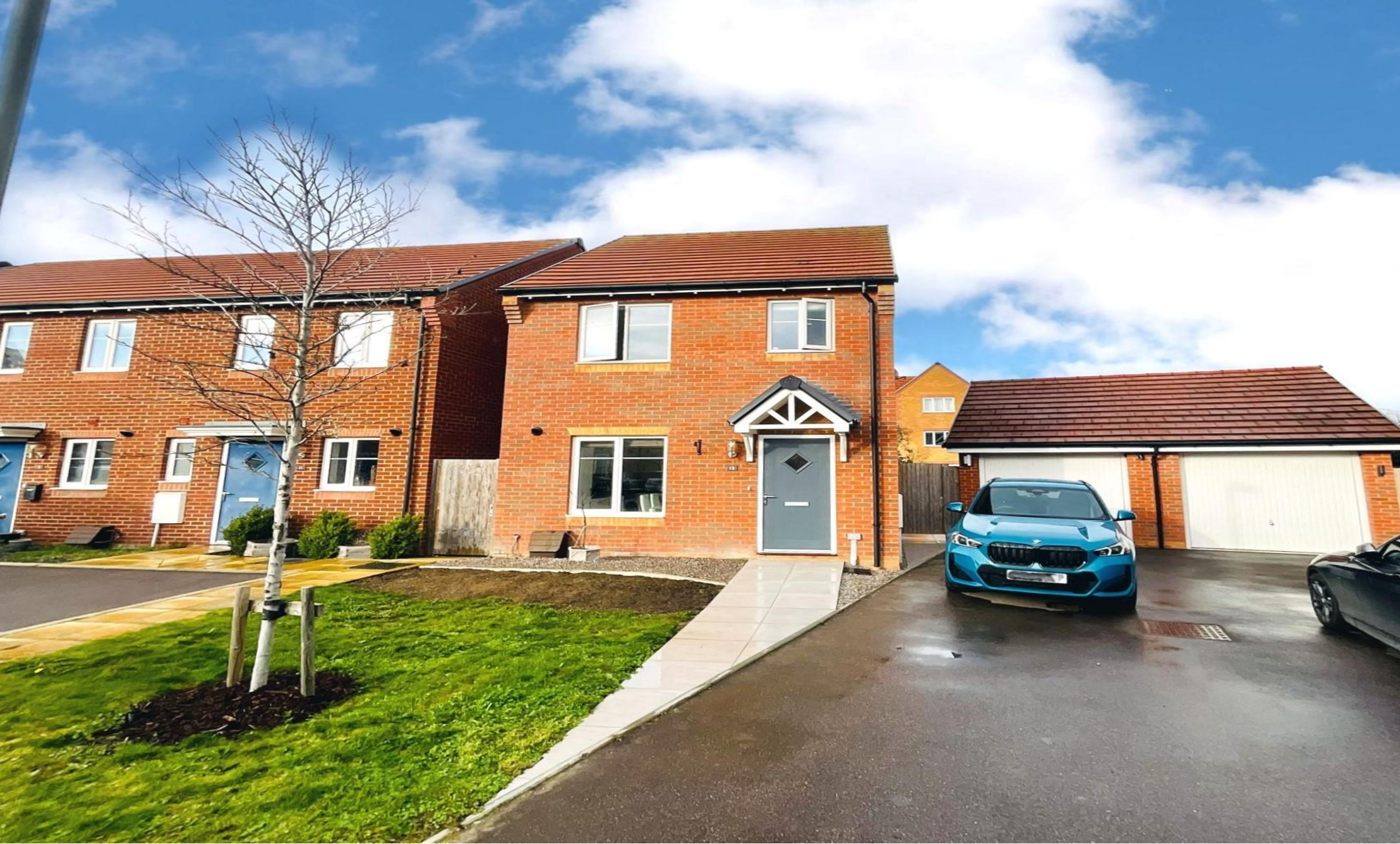
Wynton Close, Harwell, Didcot, OX11 6FG