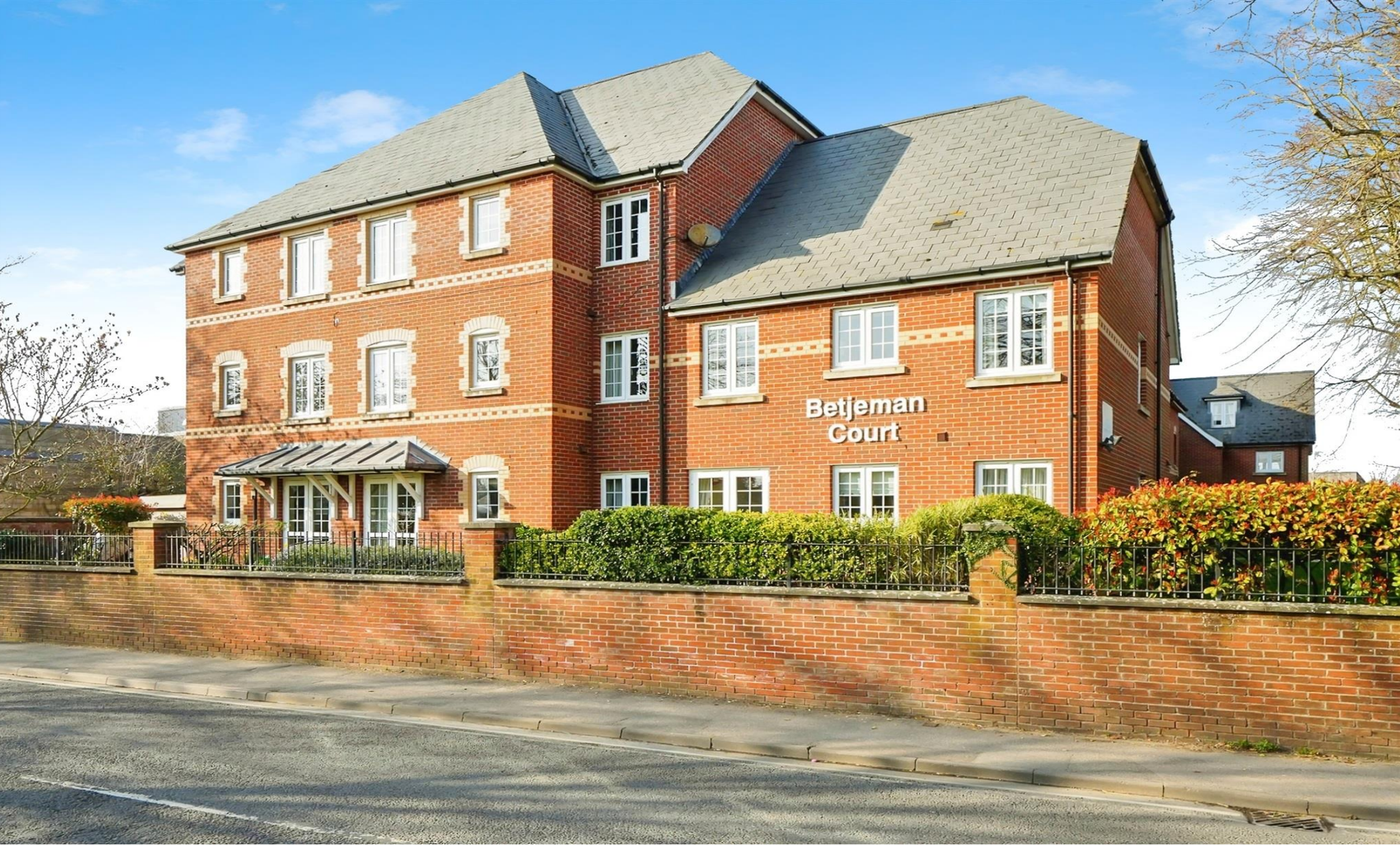
Betjeman Court, Portway, Wantage OX12 9BW