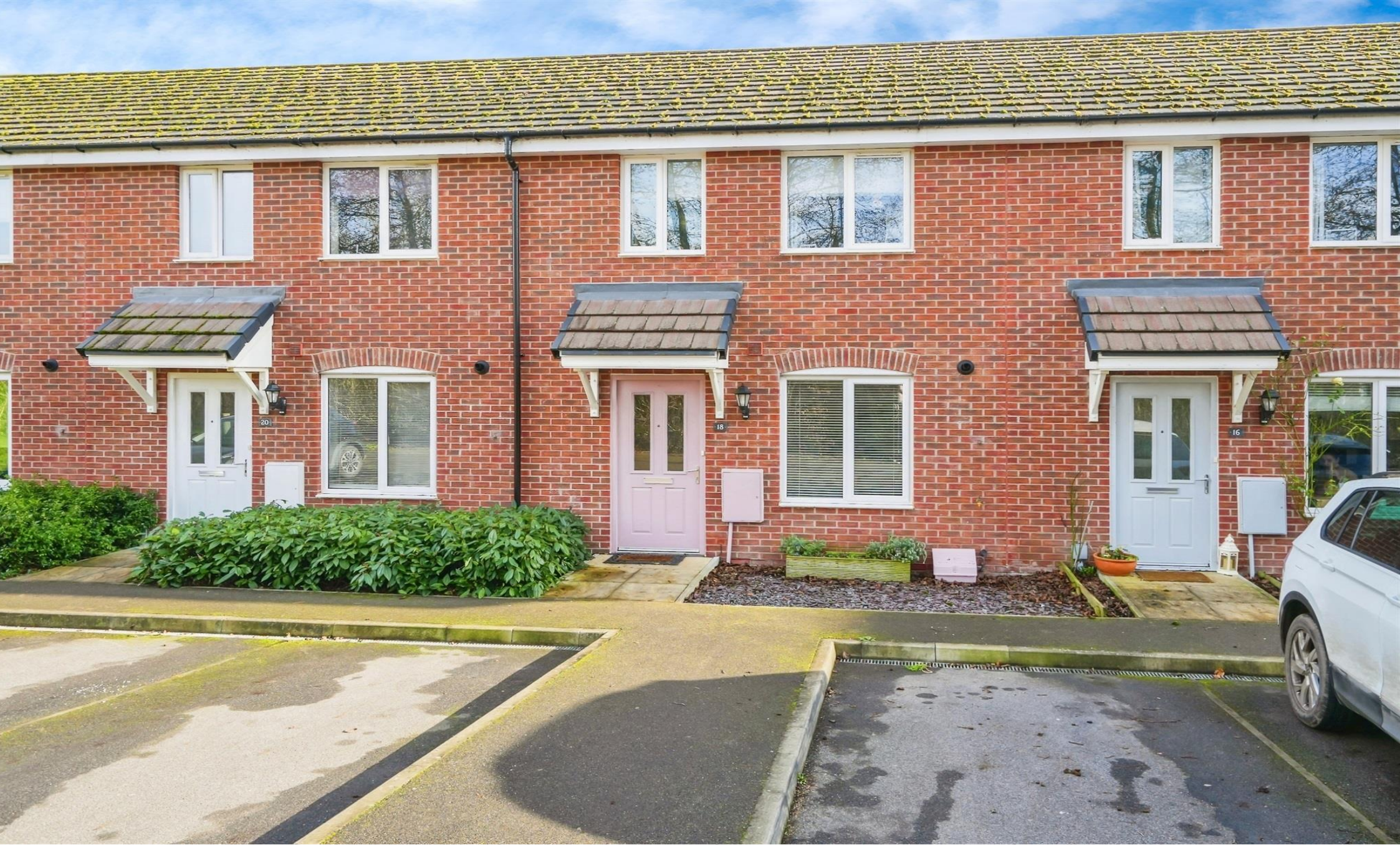
Talbot Close, Harwell, Didcot, OX11 0FB