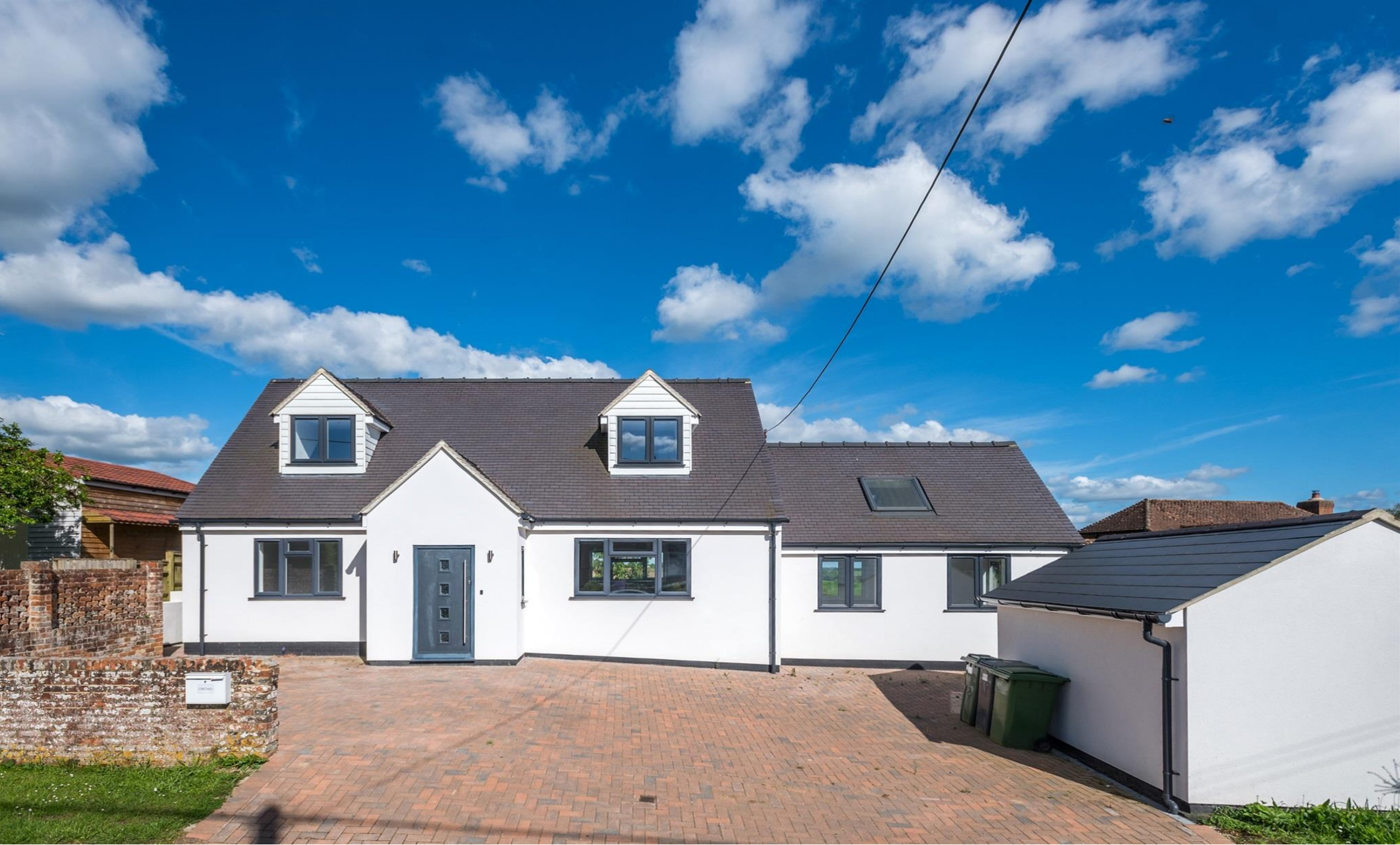
Orchid Bungalow, Shop Lane, Leckhampstead, Newbury, RG20 8QQ