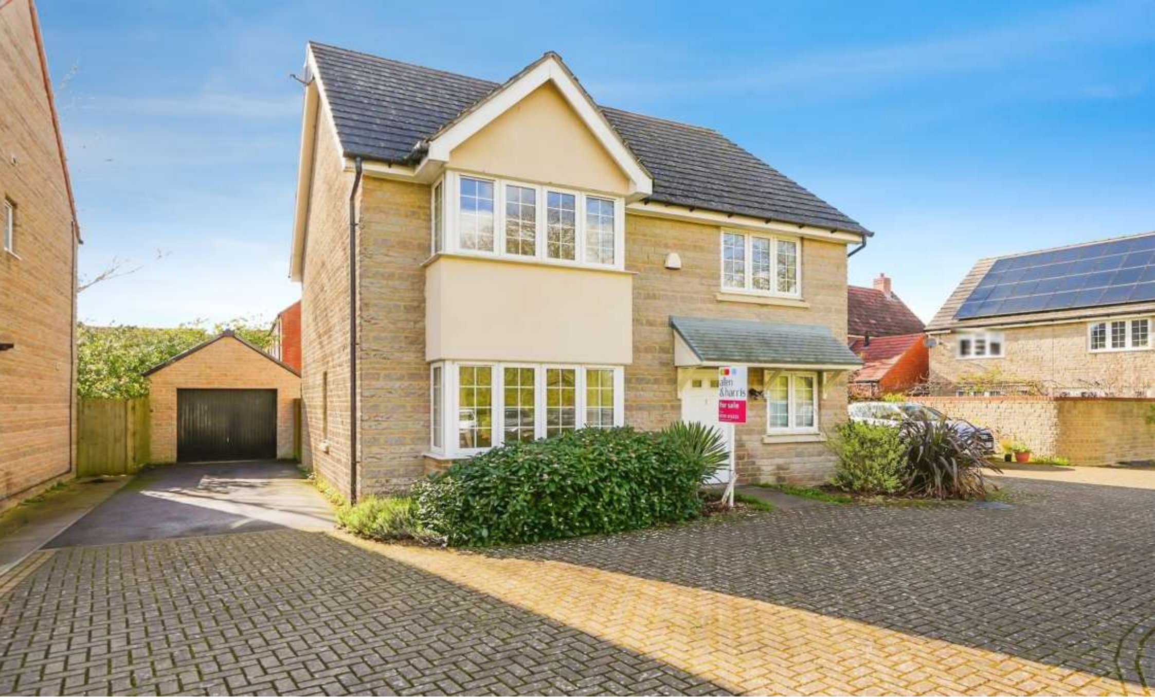
Chilton Field Way, Chilton, Didcot OX11 0SQ