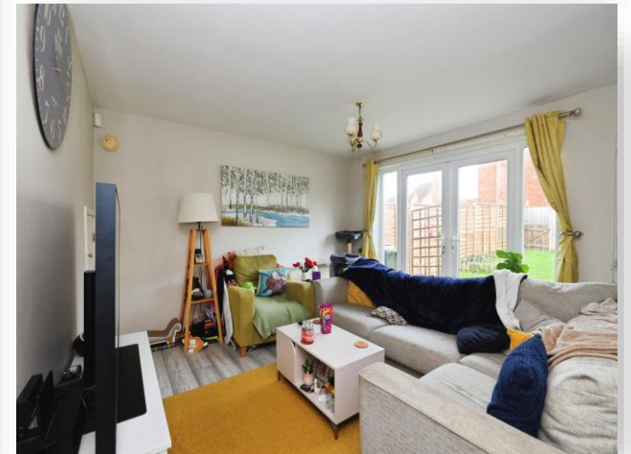
Rider Close, Devizes SN10 2RP