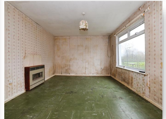
Hatfields, Marden Devizes SN10 3RL