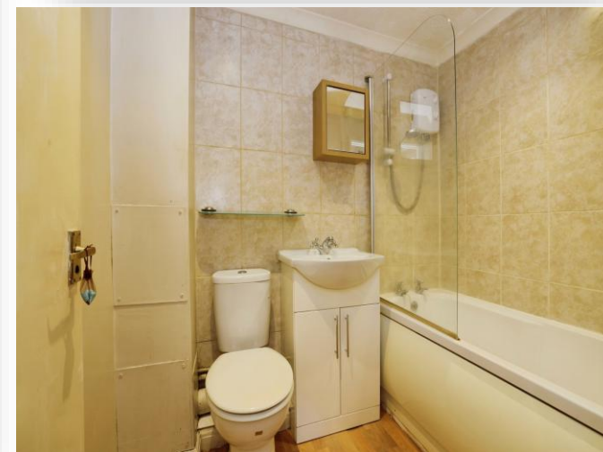
Rochelle Court, Market Lavington Devizes SN10 4AT