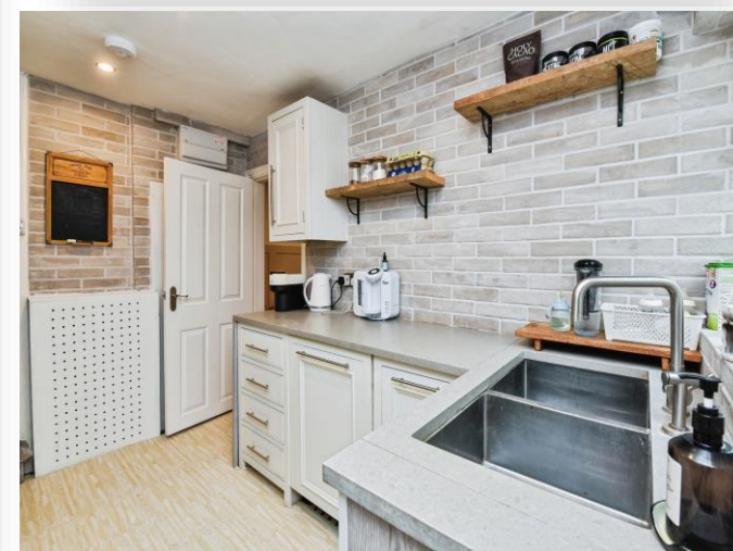
Paradise Lane, Rowde Devizes SN10 2NN