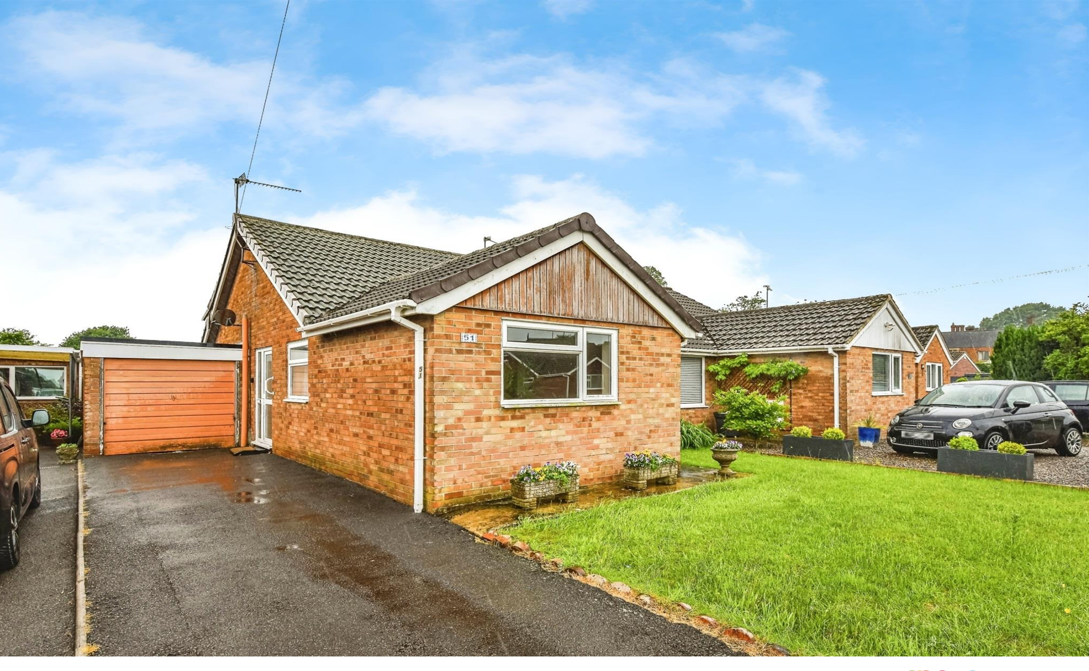
Springfield Road, Rowde, Devizes SN10 2NZ