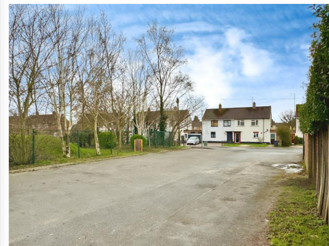
Garage Court To Rear, Brickley Lane, Devizes SN10 3BT