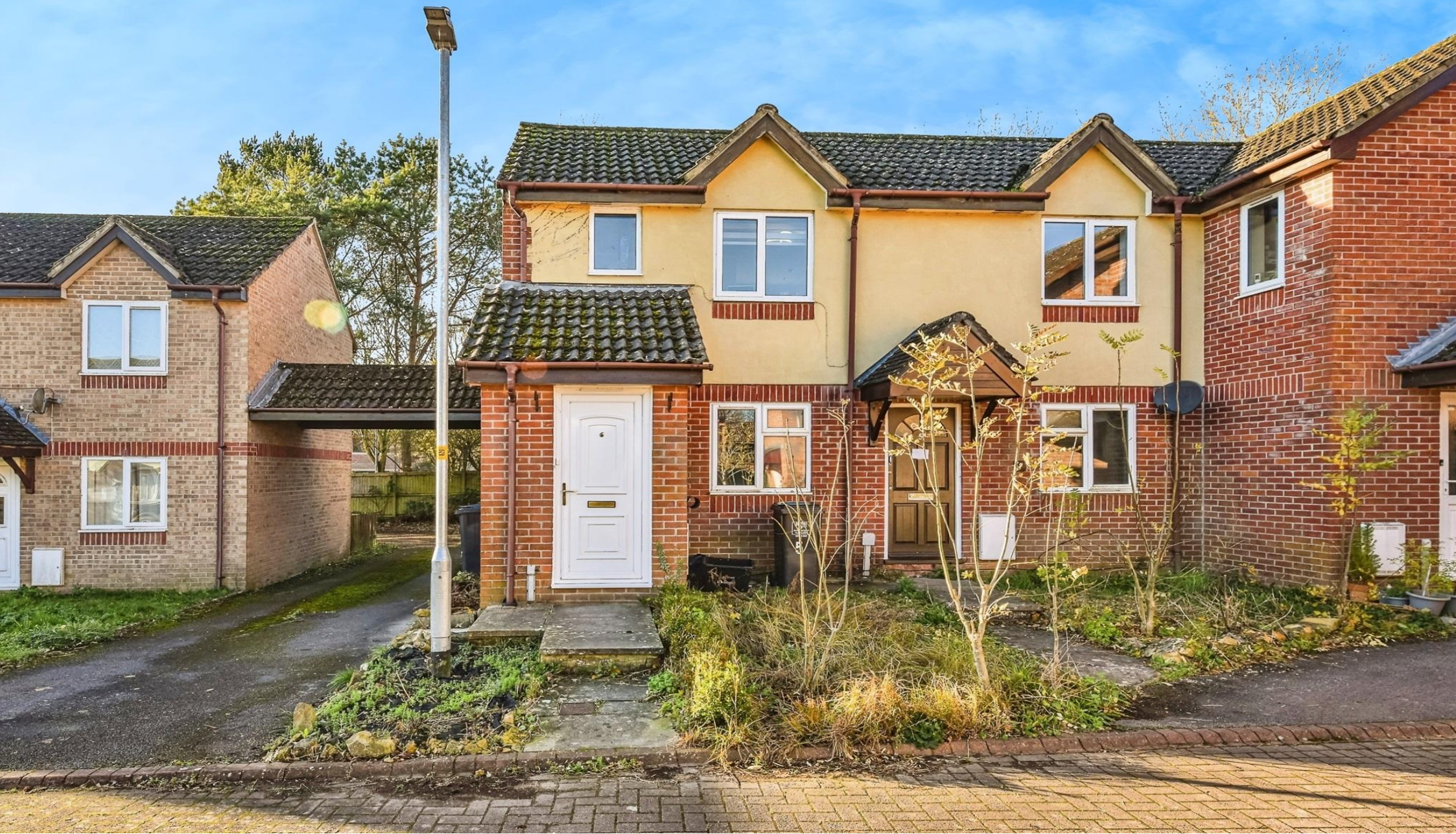
Rupert Close, Devizes SN10 2RN