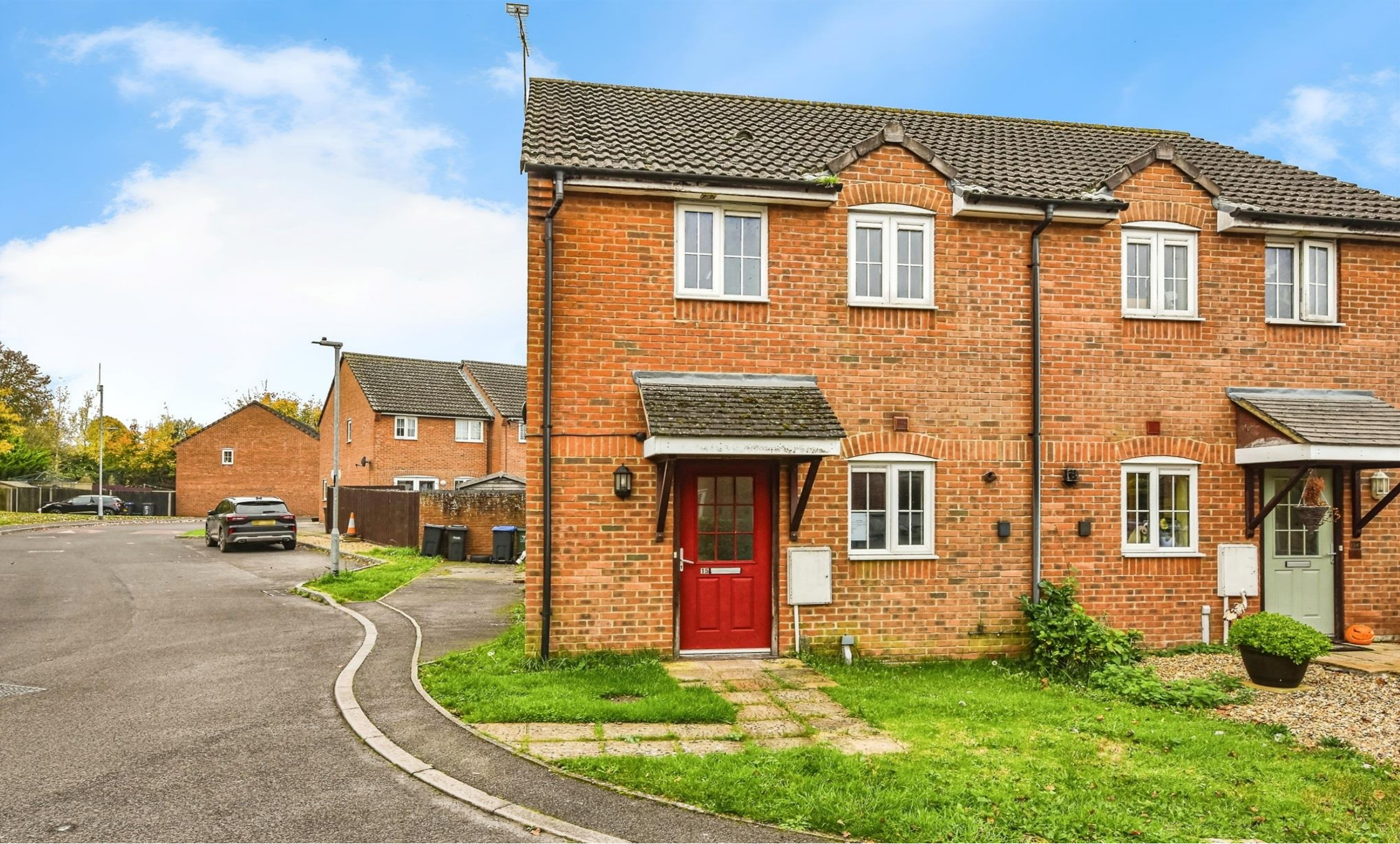
Ridgeway Close, Market Lavington, Devizes SN10 4BH