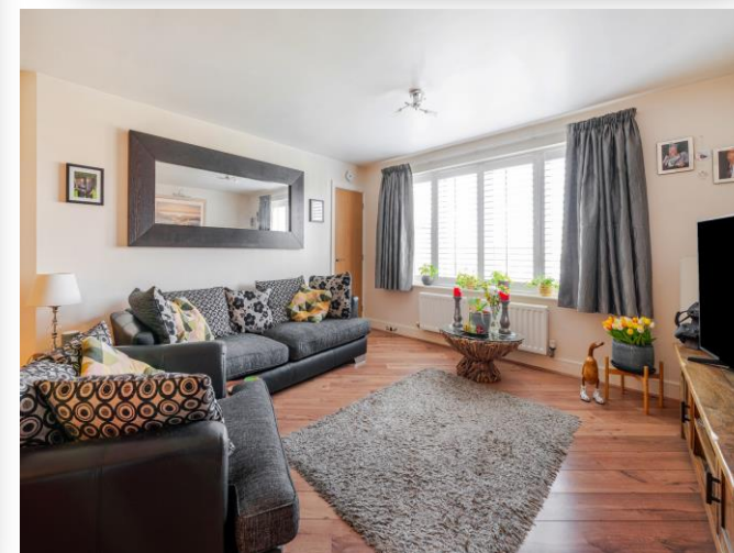
220 Burghley Court, Kingsquarter, Maidenhead SL6 1FN