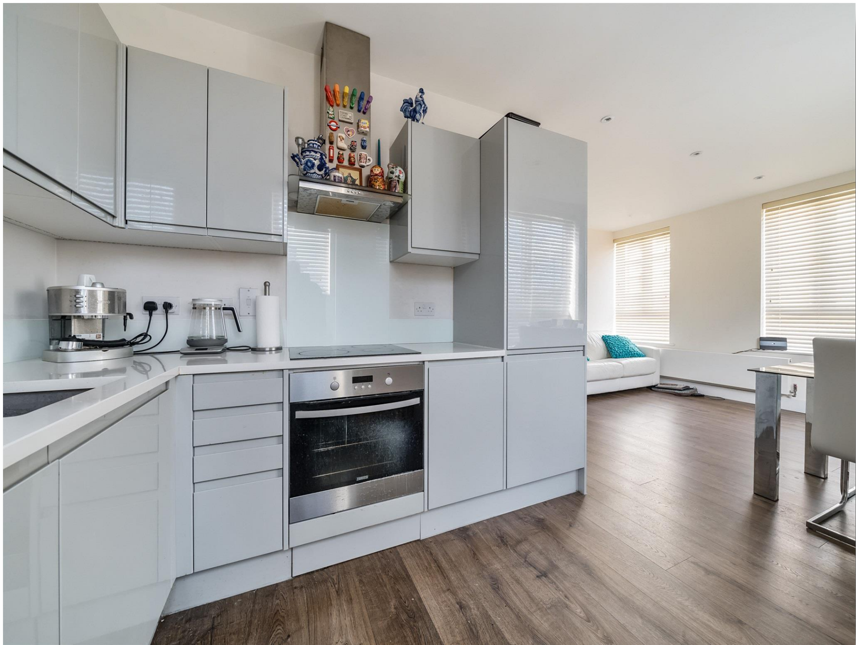
Flat 6 Shelley House, 2-4 York Road, Maidenhead SL6 1SF