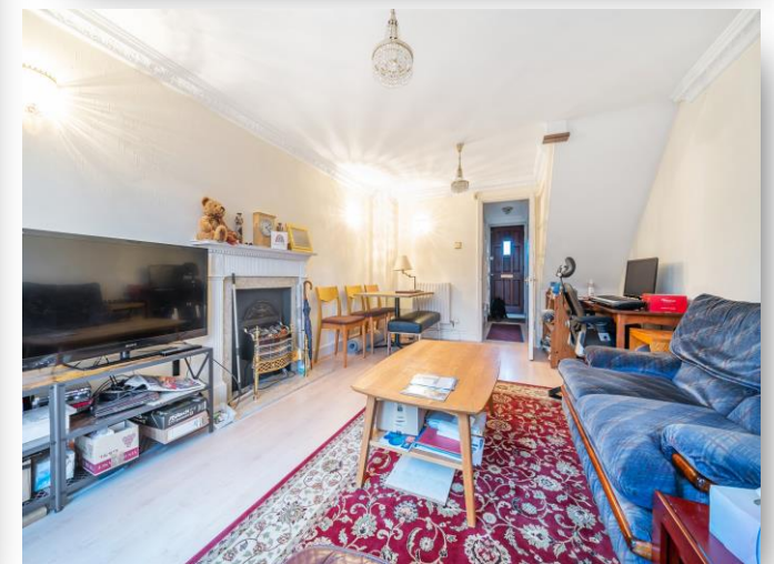
13 Tudor Court, Lower Cookham Road, Maidenhead SL6 8JH