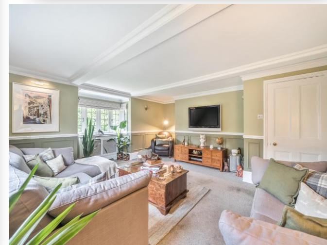
Little House, Terrace Road North, Binfield, RG42 5JG