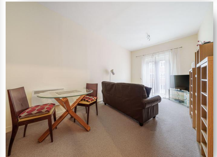
Flat 37 Park View, Grenfell Road, Maidenhead SL6 1FG