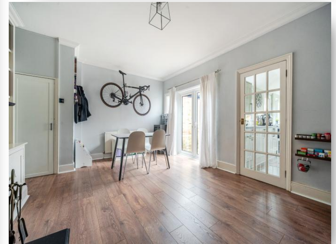
34 Penyston Road, Maidenhead SL6 6EH