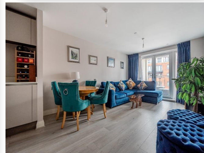
Apartment 24 Waterside Court, The Colonnade, Maidenhead SL6 1DL