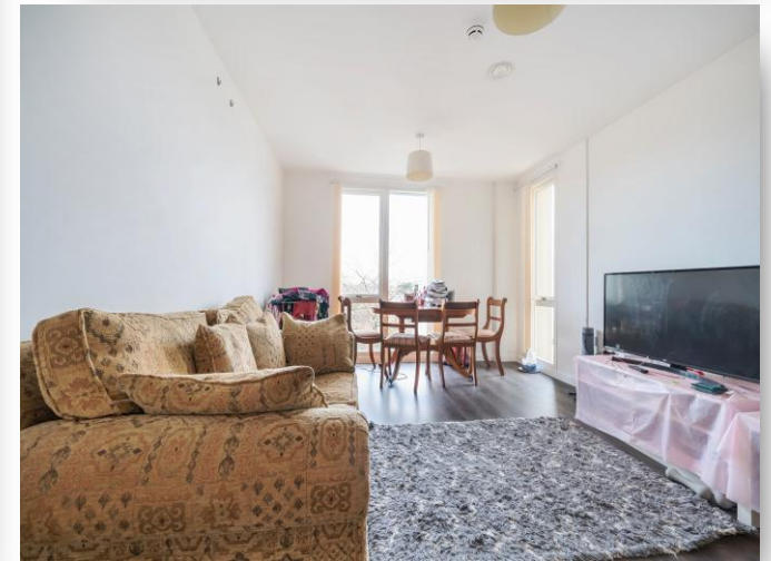
Flat 31 Medway House, 7 Kidwells Close, Maidenhead SL6 8FZ