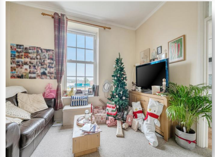
Flat 6 Queensgate House, 16 Cookham Road, Maidenhead SL6 8BD