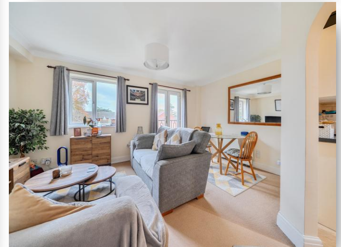
24 Lancastria Mews, Boyndon Road, Maidenhead SL6 4SA