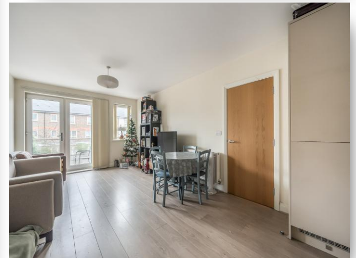
Flat 11 Heathland Court, 3 Grebe Way, Maidenhead SL6 8DE