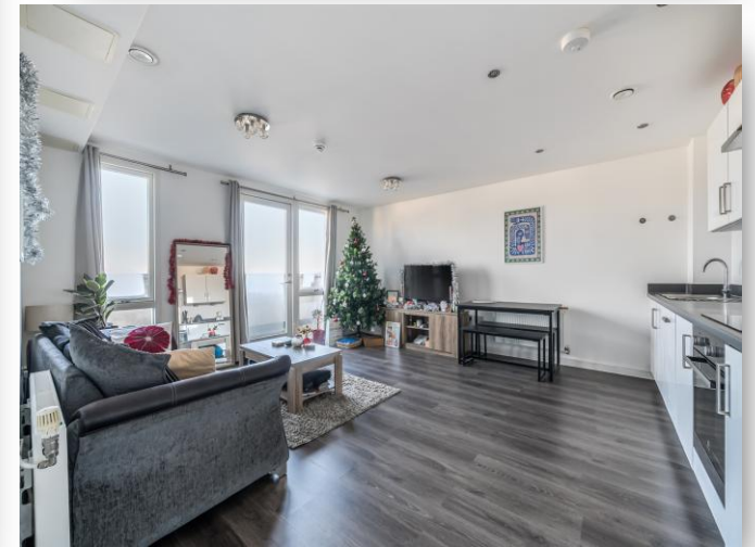
Flat 36 Lea House, 1 Kidwells Close, Maidenhead SL6 8FF