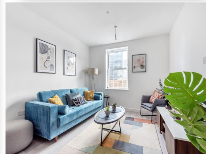
Flat 4 Rize Court, 94-96 High Street, Maidenhead SL6 1PT