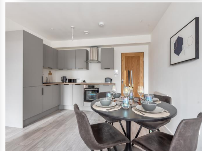
Flat 11 Rize Court, 94-96 High Street, Maidenhead SL6 1PT