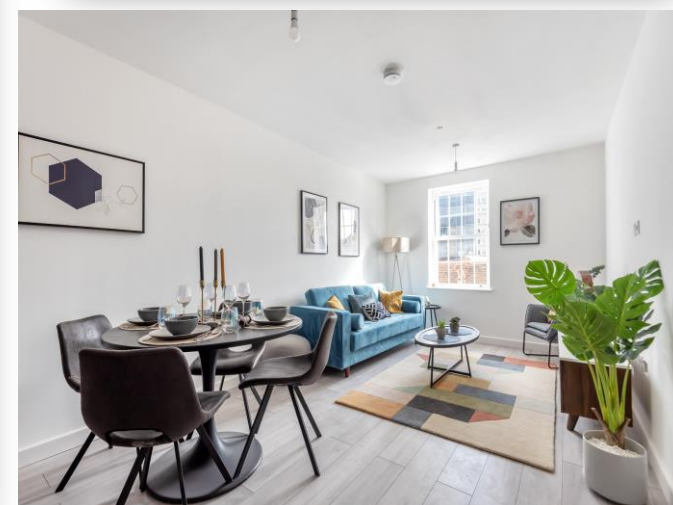
Flat 5 Rize Court, 94-96 High Street, Maidenhead SL6 1PT