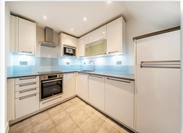
Flat 4 Ray Mill Inn, Boulters Lock Island, Maidenhead SL6 8PE