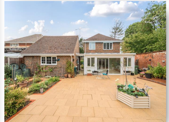
6 Juniper Drive, Maidenhead SL6 8RE