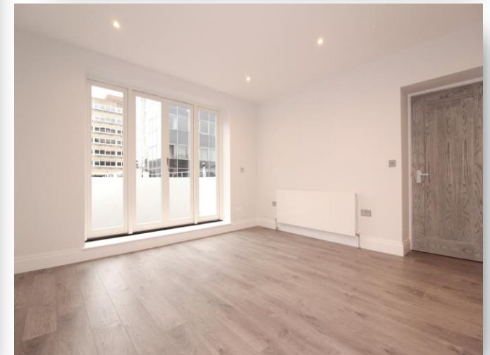
Apartment 9 Cresset Court, 73 High Street, Maidenhead SL6 1JX