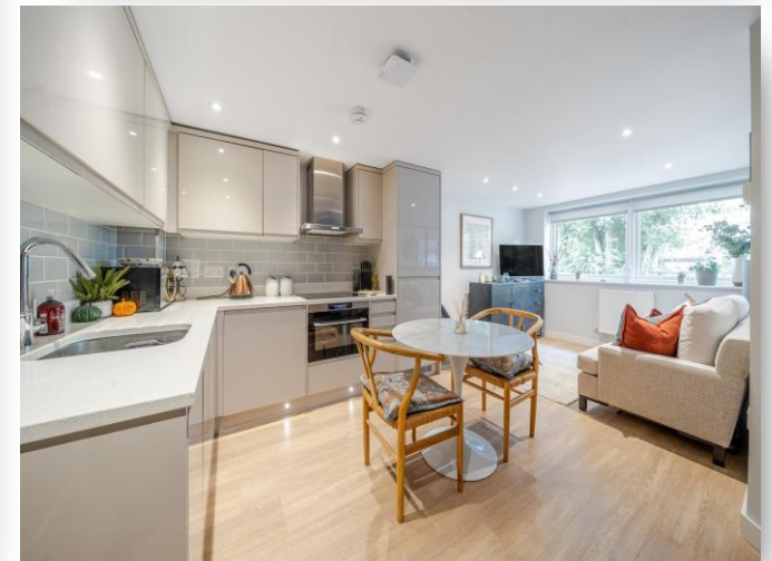
14 Lennox House, Ray Park Avenue, Maidenhead SL6 8DT