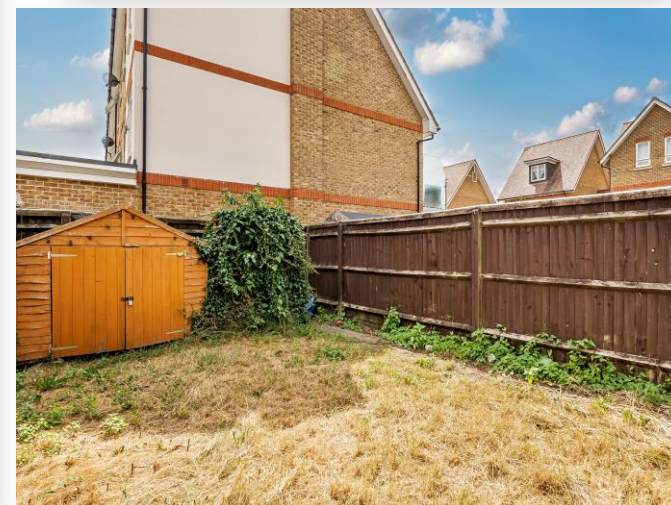
6 Kingfisher Drive, Maidenhead SL6 8EL