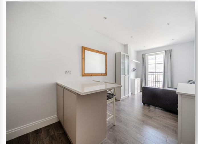
Apartment 7 Cresset Court, 73 High Street, Maidenhead SL6 1JX