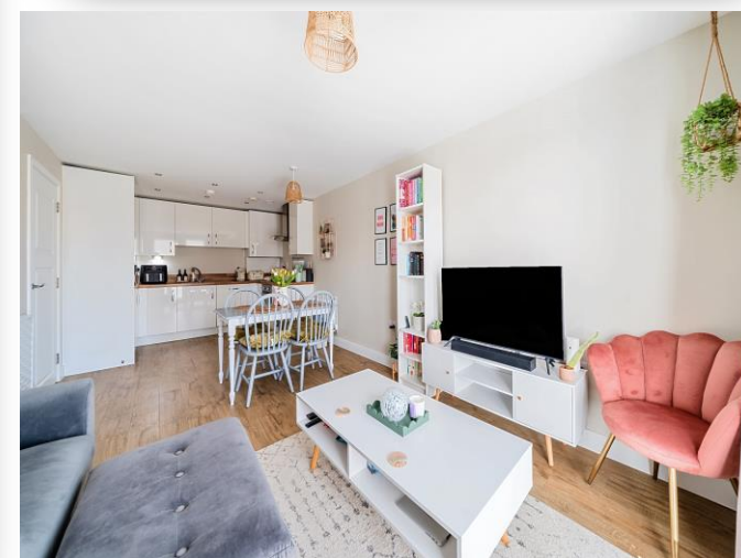
Apartment 5 Goldcrest House, 3 Kingston Close, Maidenhead SL6 1BG