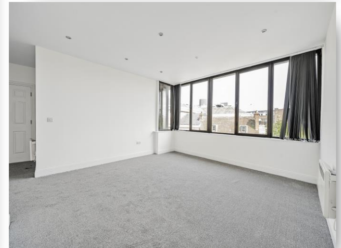
Flat 9 Butler House, 19-23 Market Street, Maidenhead SL6 8AA