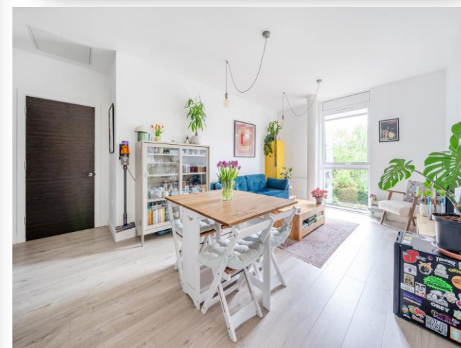
Apartment 70 St James House, Clivemont Road, Maidenhead SL6 7DY