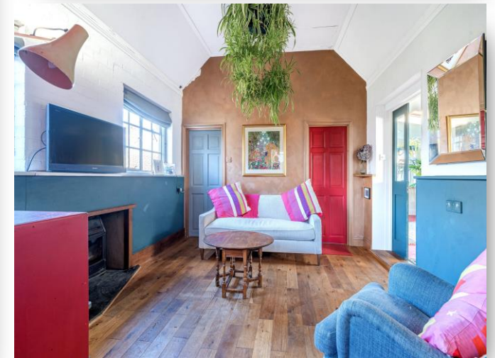
The Pump House, Bracknell Road, Warfield, Bracknell RG42 6BP