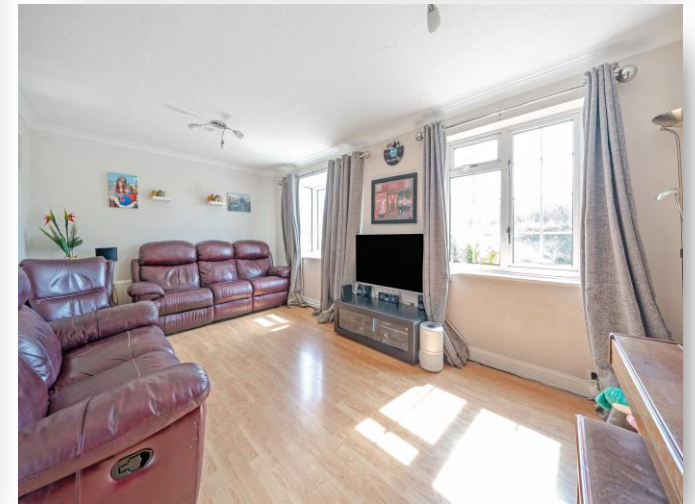
67 Lowbrook Drive, Maidenhead SL6 3XS