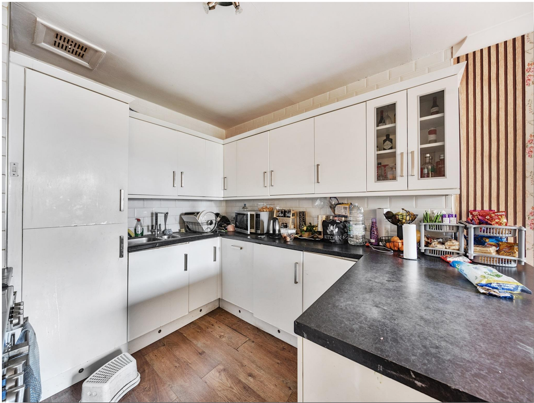
10 Glynwood House, Bridge Avenue, Maidenhead SL6 1RS