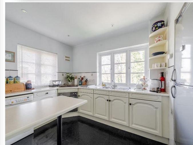
4 Wexford Court Oldfield Road, Maidenhead SL6 1TD