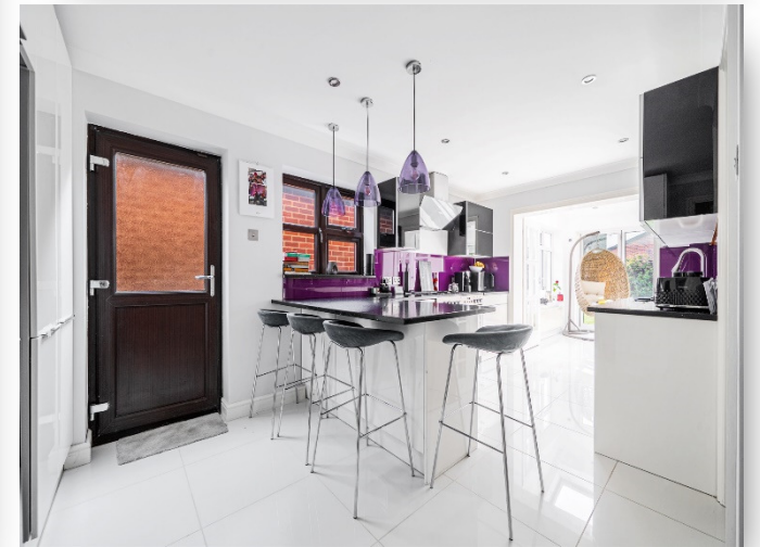
Earlsfield,Holyport Maidenhead SL6 2LZ