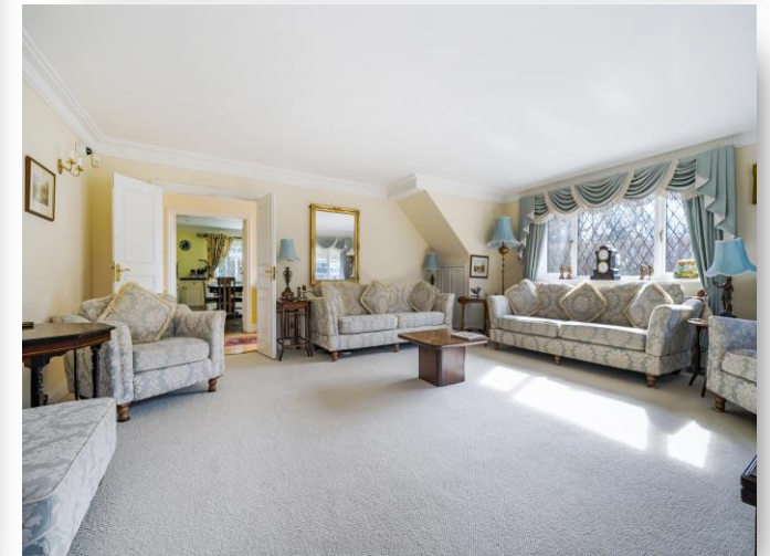
Heathwood, Hambleden, Henley-On-Thames RG9 6LT