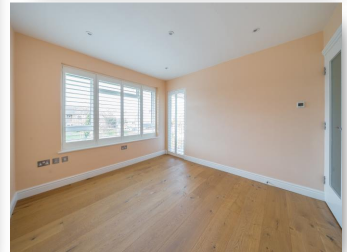
4 Prince Andrew Close, Maidenhead SL6 8QH