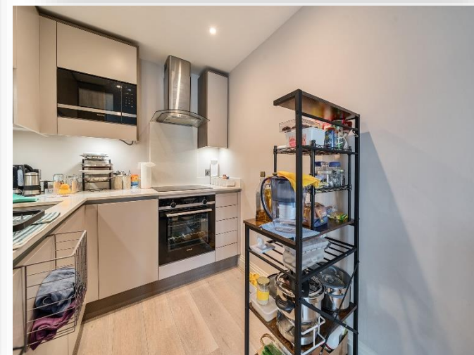
Waterside Court, The Colonnade, Maidenhead SL6 1DL