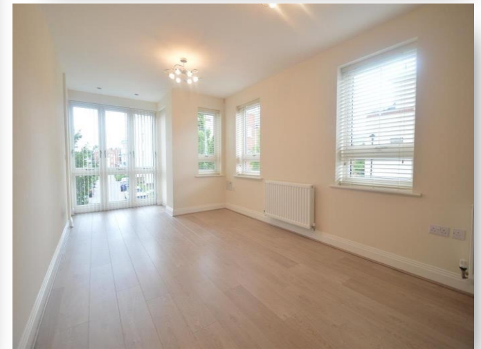
Flat 7 Moorland Place, 31 Kingfisher Drive, Maidenhead SL6 8EL