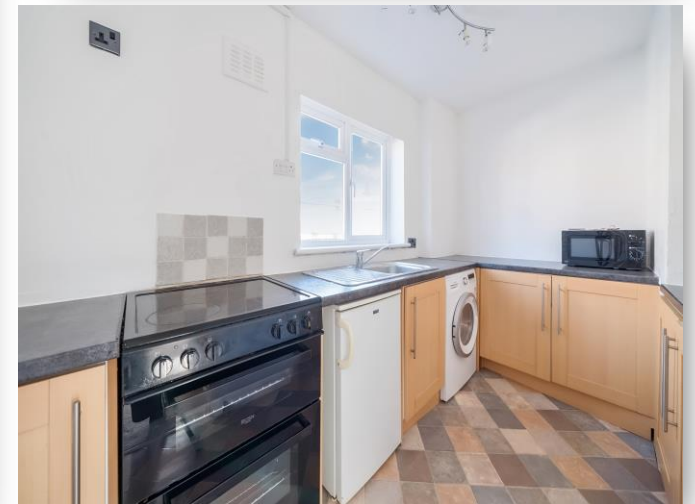
5 Marlow Lodge, Courtlands, Maidenhead SL6 2PU