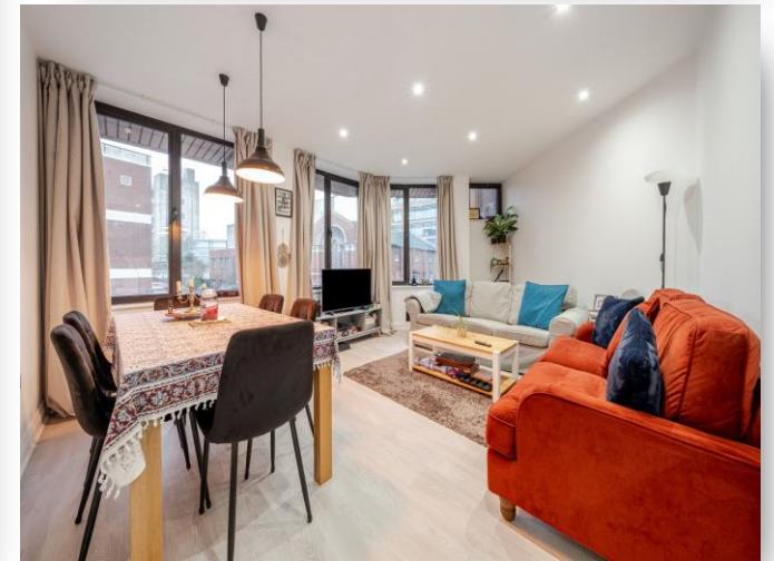
Flat 1 Butler House, 19-23 Market Street, Maidenhead SL6 8AA